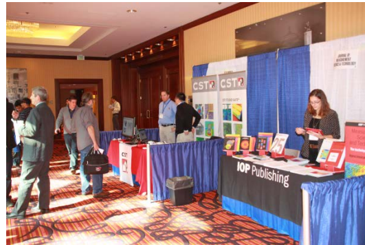
Exhibitors at the IEEE SENSORS 2013 Conference